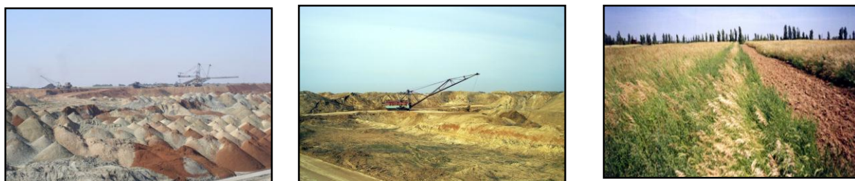
Fig. 1. Pokrov (Ordzhonikidze) mine site. Overburden removal, land reclamation research field.

table level, and reduce crop yields for quite some distance from the mine. This land can be returned to agricultural production (Fig.1). Land reclamation is particularly relevant due to large-scale manganese mining (about 75.0 % of manganese-ore) in the Nikopol district of Dnipropetrovsk region.